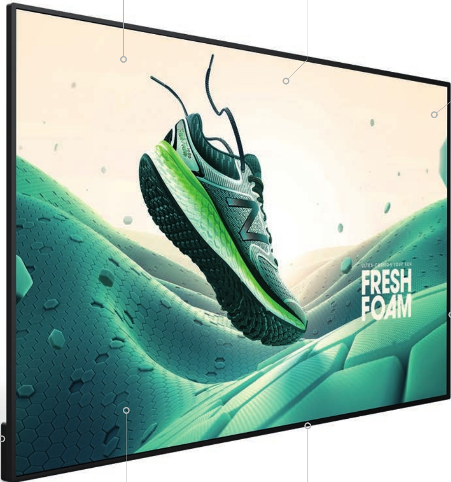
OPTIONAL OPS PC